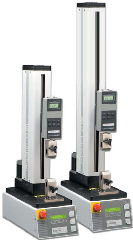
^ The ESM301 and ESM301L are shown in typical configurations with Series BG digital force gauges and G1008 film & paper grips

The ESM301 and the new ESM301L are highly configurable motorized test stands for tension and compression testing applications up to 300 lb (1.5 kN). The stands can be controlled from the front panel or via computer. The ESM301/ESM301L is engineered on a unique modular platform, allowing for "build-your-own" configurability. Features can be ordered individually at time of order or activated in the field. Integrated travel indication, overload protection, and a host of programmable parameters makes the ESM301/ESM301L quite sophisticated, while its intuitive menu structure allows for quick, simple setup and operation. A password can be programmed to prevent unauthorized changes. With a rugged and modular design, the test stand is a compelling solution for applications in laboratory and production environments.