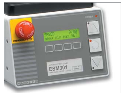
^ Digital controller contains a backlit LCD screen with menu choices for ease of setup and operation