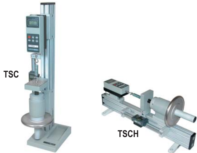
The TSC and TSCH are shown in a tension spring testing application, with Series BG digital force gauge, digital travel display, and hooks